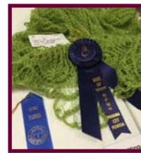
A 2014 Blue Ribbon winner for knitting

Proudly display your handwork. You just might win!